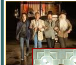
Gospel Music Radio